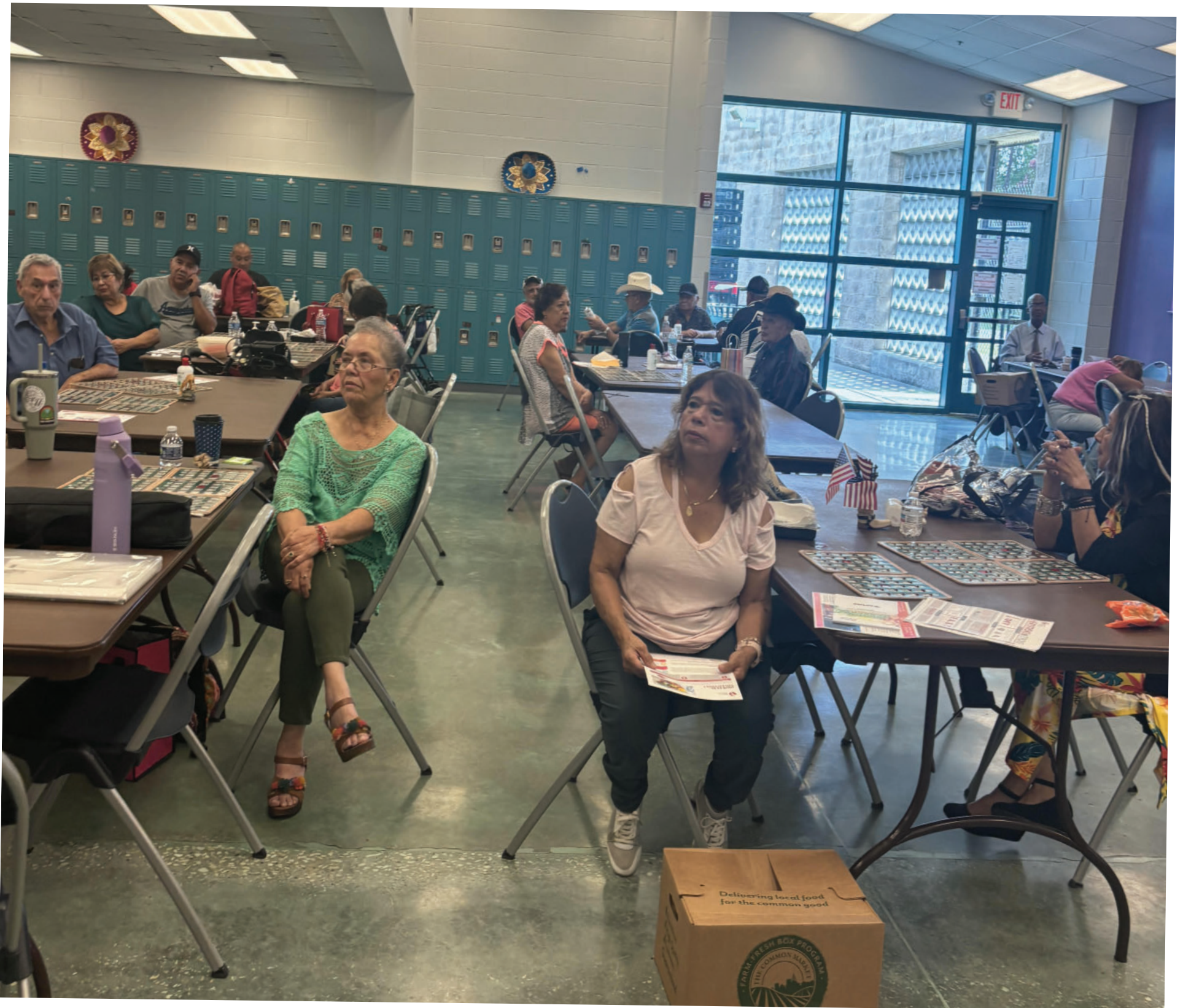
ABOVE: Seniors listening to County Clerk leading a workshop on Chapter 42 at a Denver Harbor Cares event.